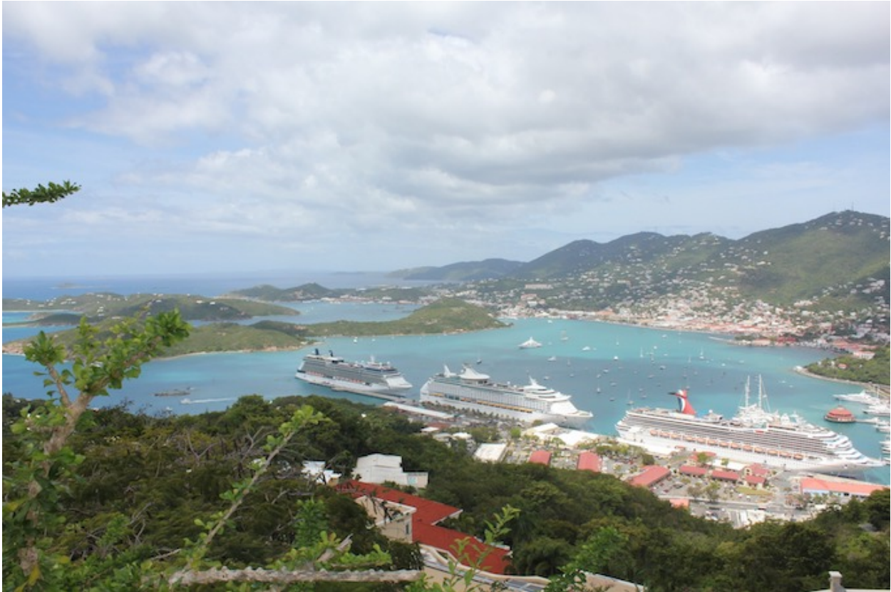
U.S. Virgin Islands Slot Machine Casino Gambling 2018