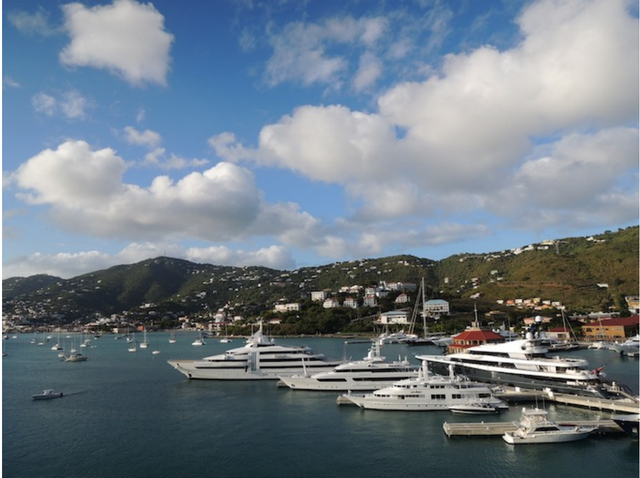
U.S. Virgin Islands Slot Machine Casino Gambling 2018: The island of St. Thomas.