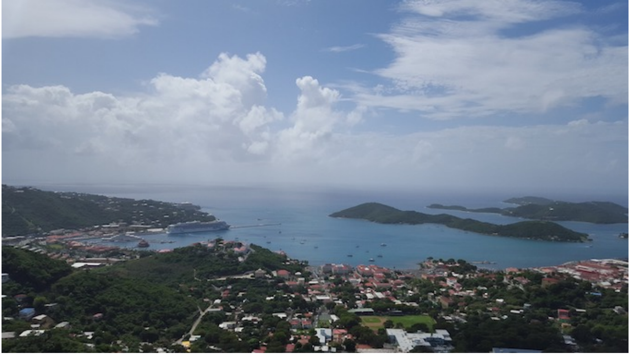
U.S. Virgin Islands Slot Machine Casino Gambling 2018