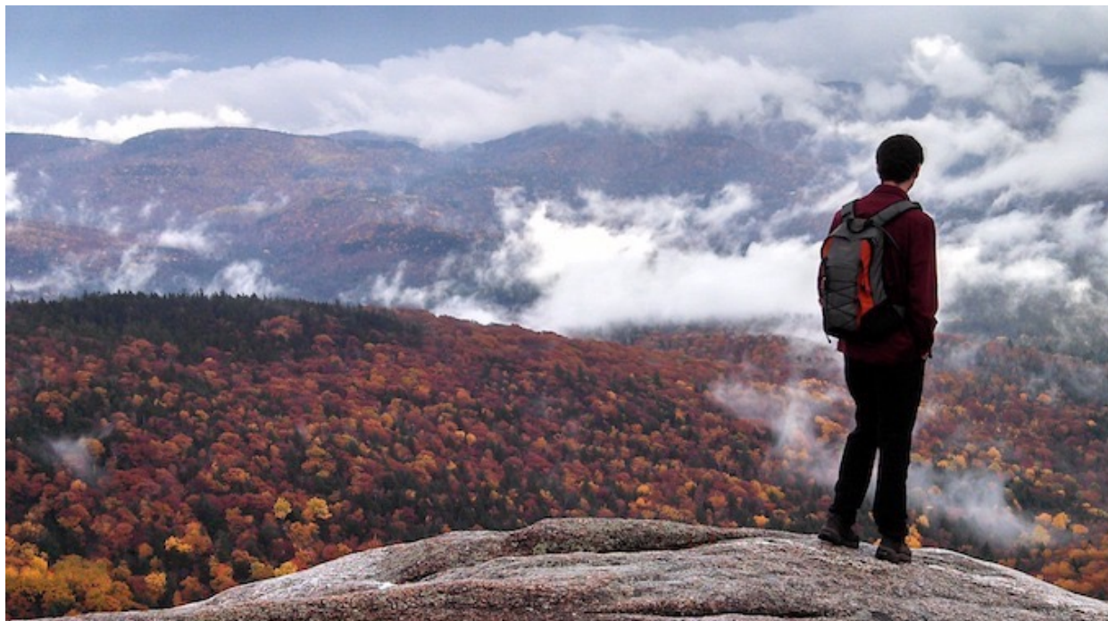
New Hampshire Slot Machine Casino Gambling: Hiking on the Appalachian Trail.

It is legal to privately own a slot machine in New Hampshire if it is 25 years old or older.