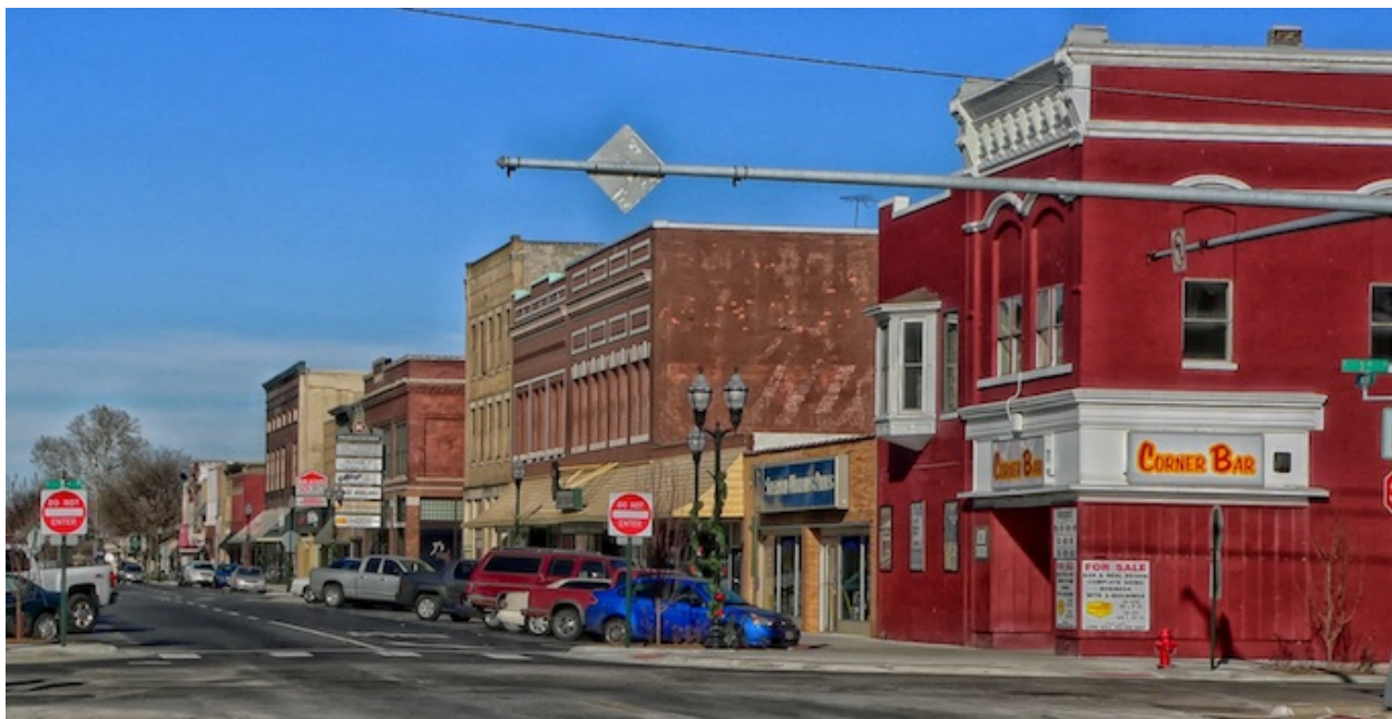
Nebraska Slot Machine Casino Gambling: The City of Fremont.