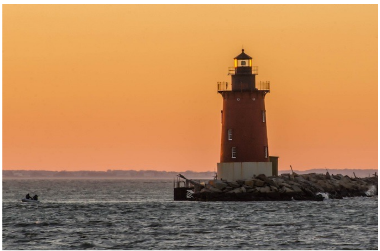
Delaware slot machine casino gambling: Delaware Breakwater East End Light.

This post continues the weekly blog series "<u>Slot Machine Casino Gambling, State-By-State</u>", a year-long online resource project dedicated to guiding slot machine gambling enthusiasts to success.