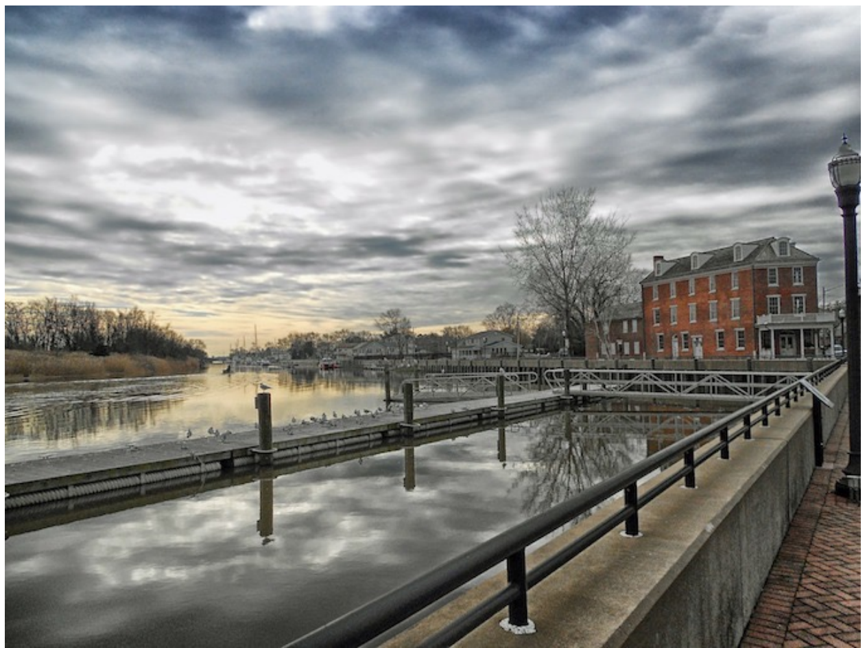
Delaware slot machine casino gambling: Delaware City, New Castle County, Delaware.