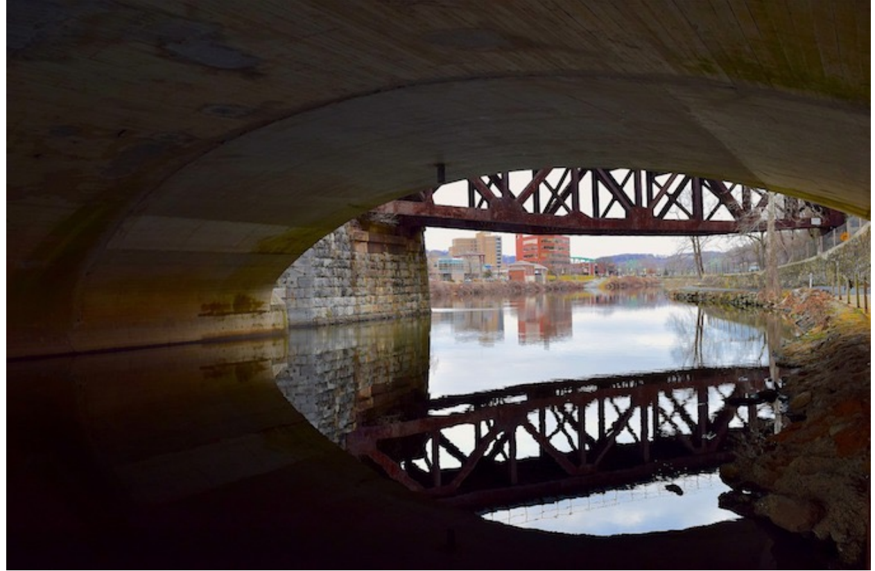
Delaware slot machine casino gambling: Delaware River Tunnel.

In early 2010, the Delaware legislature further approved table games for these casinos. This was done to help Delaware casinos compete with casinos within its neighbor states.